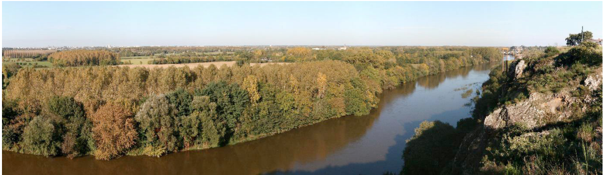
The Loire Valley.