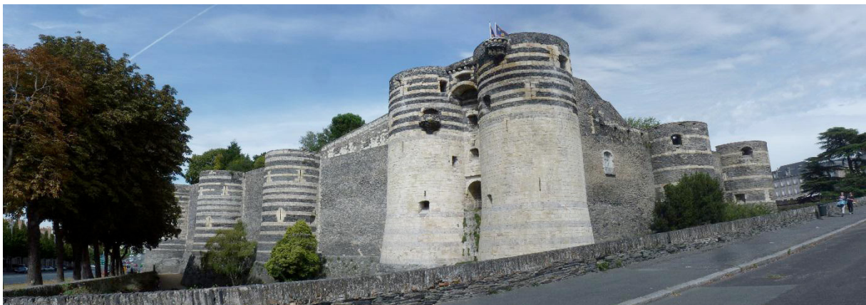
The castle of Angers, black rocks are from the "Anjou Noir" and the white ones from the "Anjou Blanc".