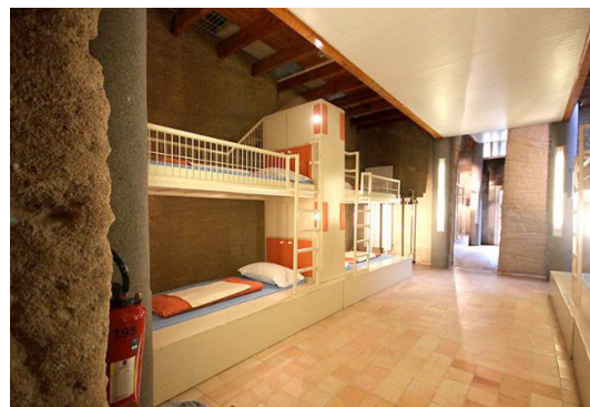
Accommodation center in Les Perrières (cave-dwelling bedrooms and dining room).